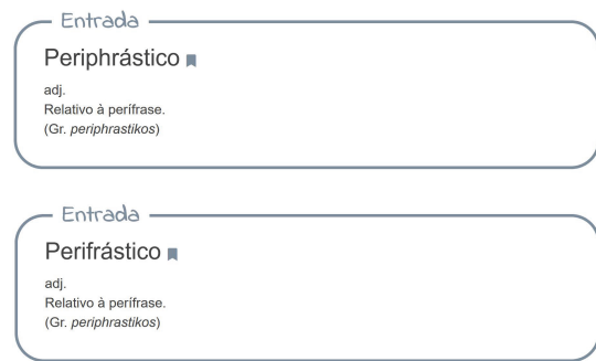
Figure 2: perifrástico [periphrastic] and perifrástico [periphrastic] in DA

For this task, we have ignored the old orthographic variant forms of a given lexical unit, as they are present in duplicate in DA (with an updated version of the form). Since the DLPC is a contemporary dictionary, these orthographic